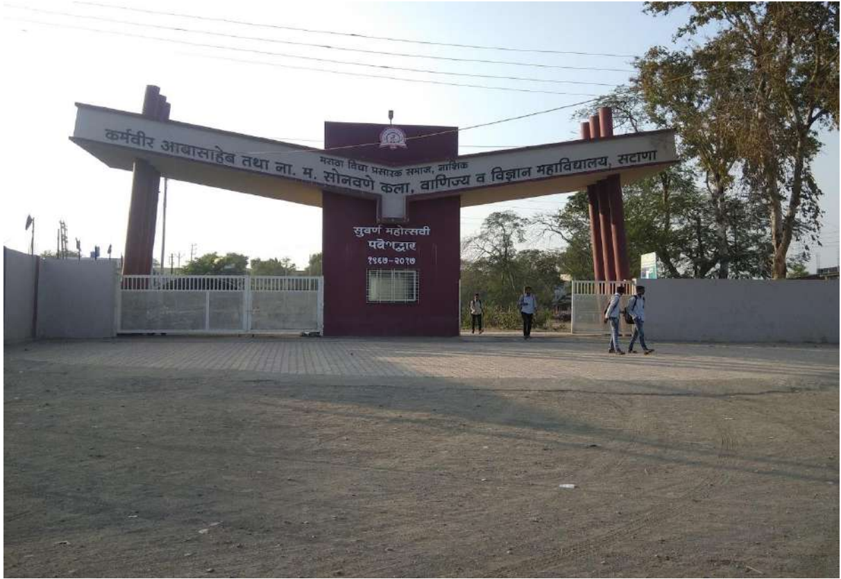
College Gate Entry