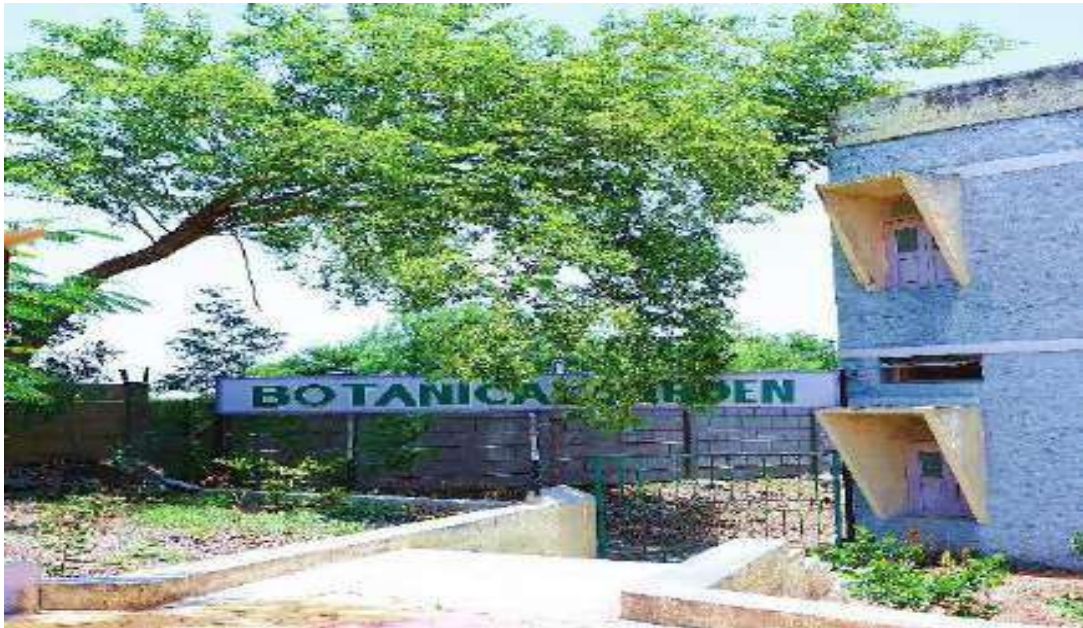
Front Space of College