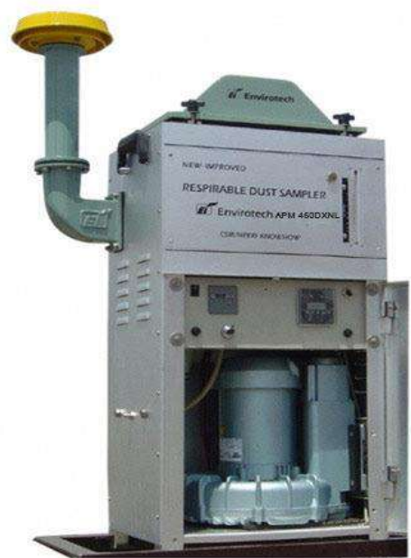
Low Volume Sampler