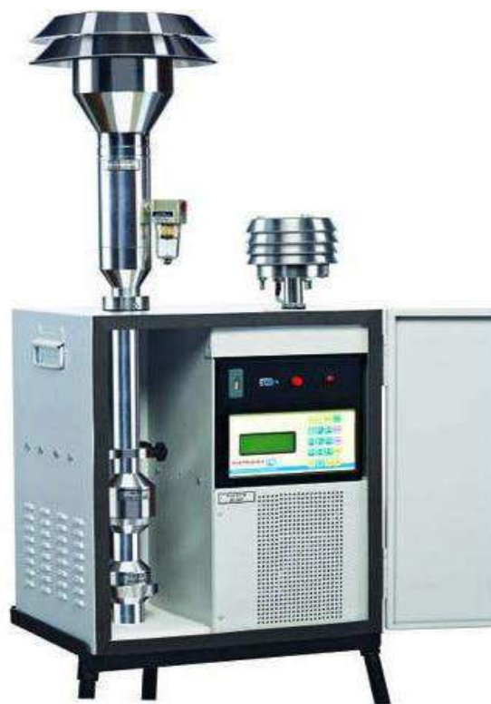
High Volume Sampler for Ambient Air Monitoring

Air is one of the essential elements for sustainability of life on this planet. This is often most polluted by humans along with water. It is required monitor its quality frequently to establish its goodness. Physically due to greenery and absence of polluting industries are processes in the vicinity the air quality appears to be very good. In addition, the parking area and bus bay are maintained clean by paving and regular cleaning giving no scope for dust rise. Also, the road sides are all covered with plants and trees aiding for good air quality.