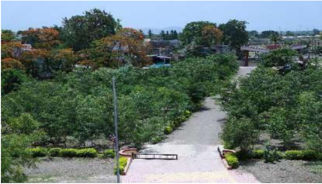
Main Building Green