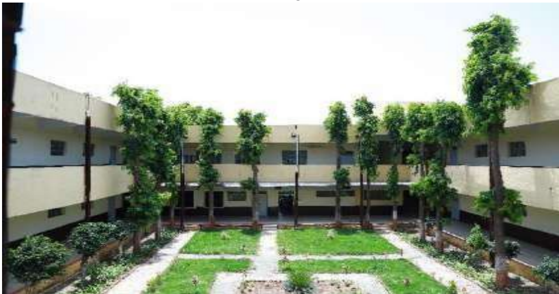
Competitive Exam Green Spot