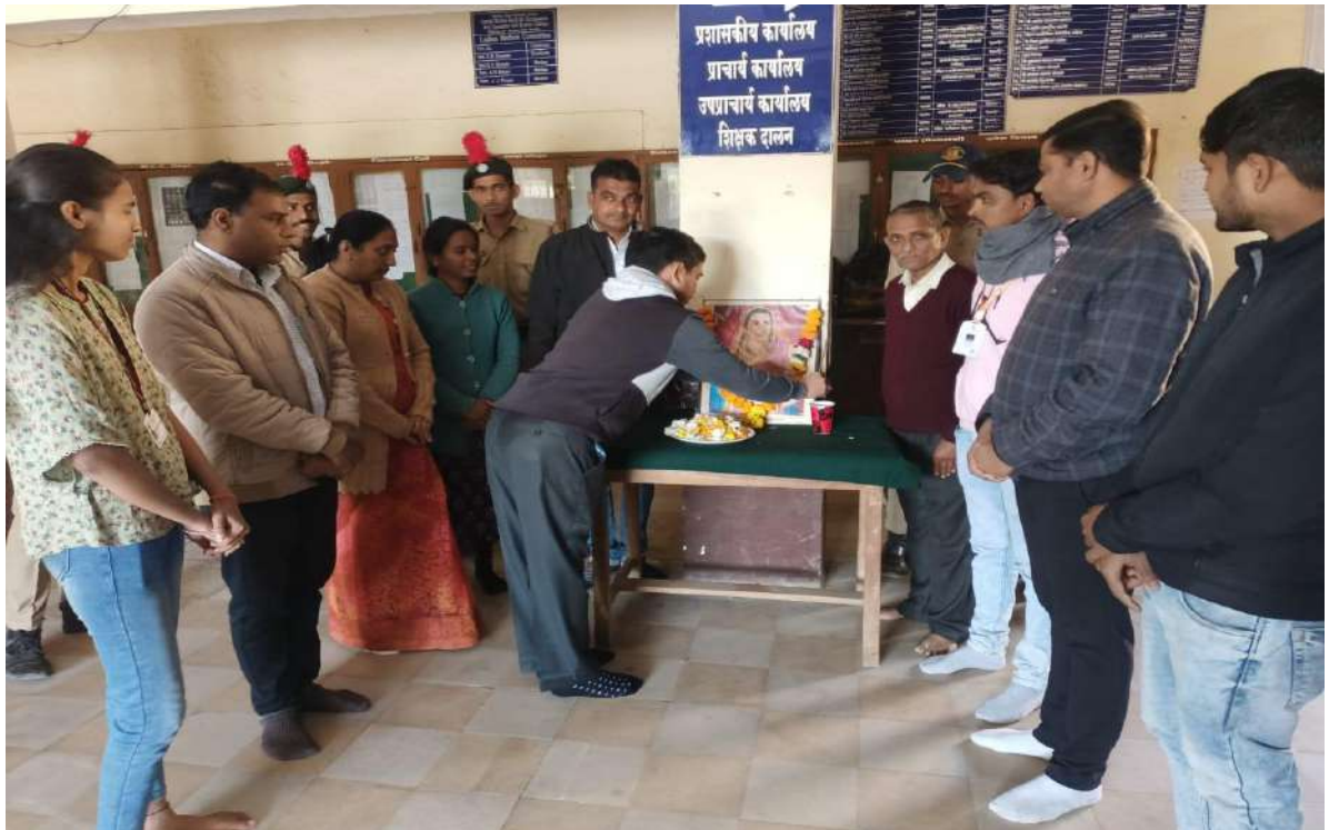
Rajmata Jijau Jayanti