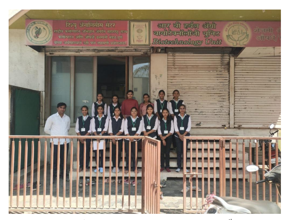
Chemistry Department field visit to a biotechnology unit. On 20<sup>th</sup> December 2023