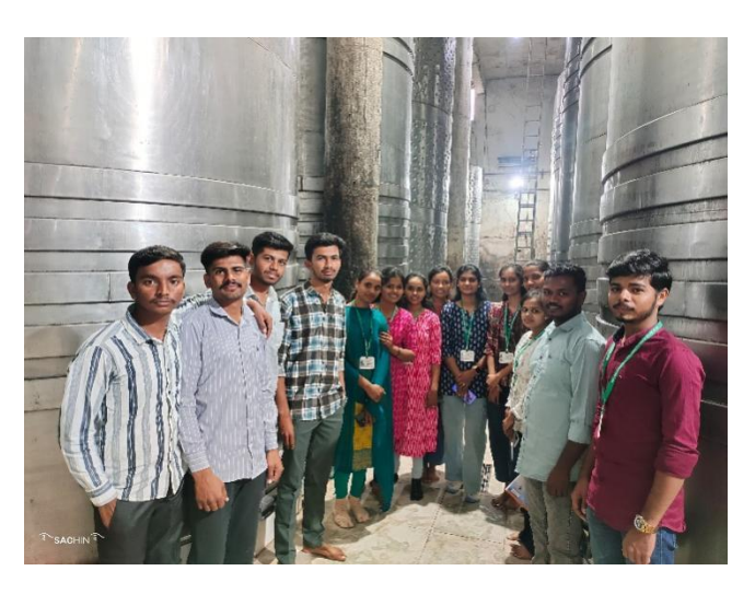
Chemistry Department field visit to a Winery unit on 20th Dec 2023